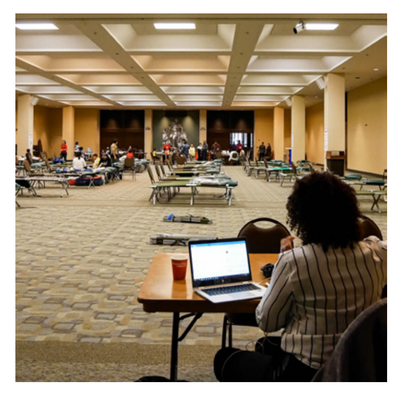
The St. Mary's shelter is equipped to support 200 people.